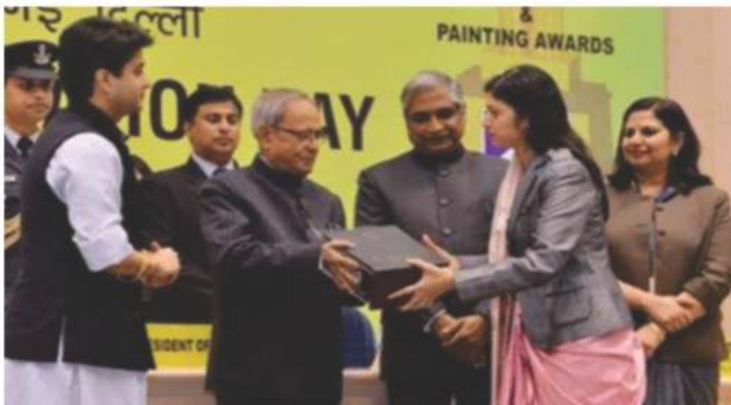
The President of India, Shri Pranab Mukherjee, presenting the Awards at the inaugural function of the National Energy Conservation Day - 2012 at Vigyan Bhawan in New Delhi on December 14, 2012.

The Participating units of EC Award 2012 have collectively invested Rs. 1948 Crores in energy conservation measures, and achieved a monetary saving of Rs. 2886 Crores last year, imply a payback period of 8 Months only, once again providing the fact that energy conservation is a least cost option. The participating units have also saved electrical energy of 4177 Million kWh, which is equivalent to the energy generated from a 616 MW thermal power station at a PLF of 0.775. In other words, these participating units have avoided the installation of power generating capacity equivalent to 616 MW thermal Power Station in 2011-12, which would otherwise have been required to meet the power demand of these units.